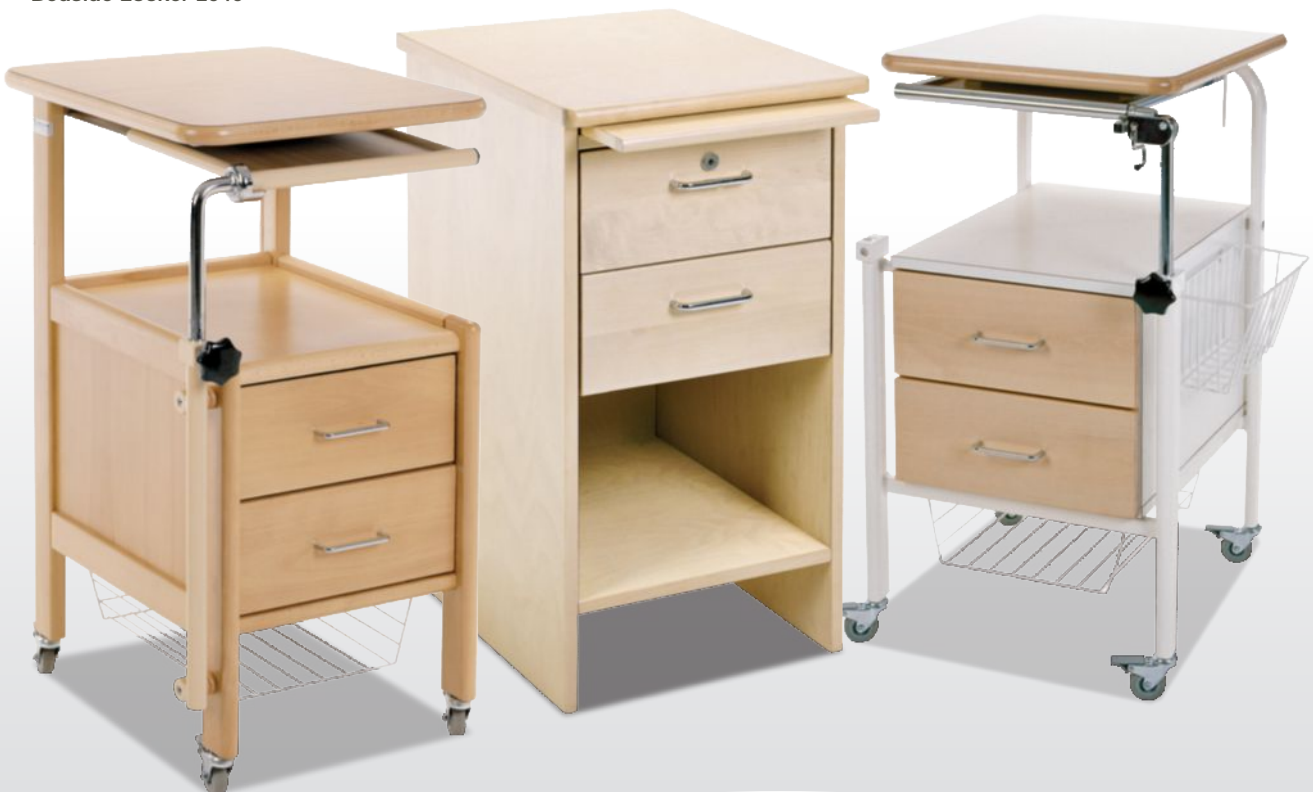
Bedside Locker 2020