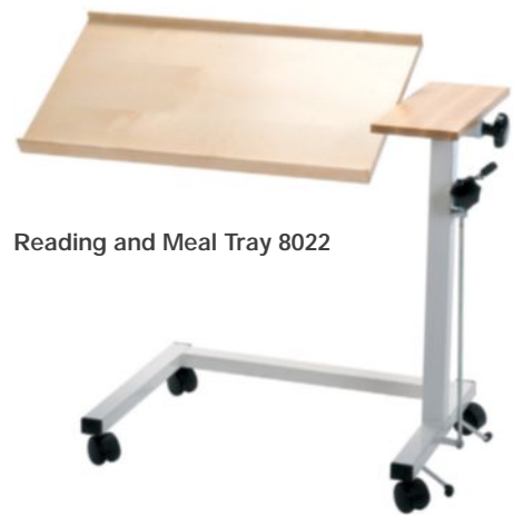
Reading and Meal Tray 8022

"Comfortable, stylish and high quality."