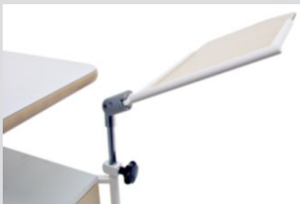
Meal tray, tiltable